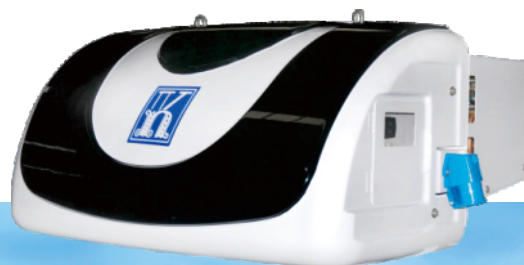
Refrigeration unit for trailer