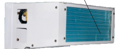
Cold air output Evaporator. Dual cooling fan.