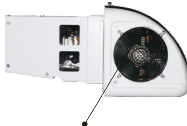
Cooling fan of Condenser.